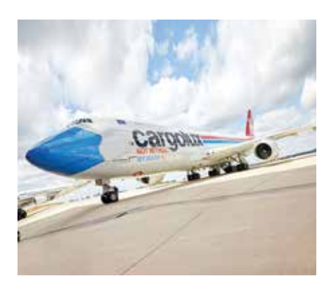
Dedicated cargo operator Cargolux came in at number eight followed by Kalitta Air at $1.7 billion.

Turkish Airlines, not often talked about in the same terms as the others as a cargo carrier, generated $3.3 billion of cargo revenues.